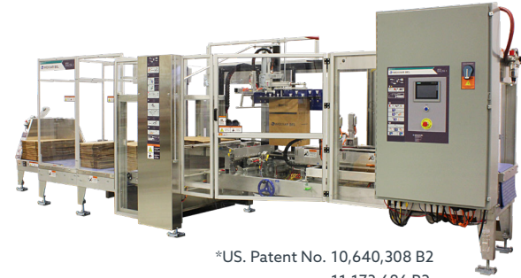
*US. Patent No. 10,640,308 B2 11,173,686 B2

The MXM System is a modular magazine system with a low load height with expandable capacity for easy, ergonomic case loading. The DELTA 1 can start forming cases within seconds of loading the first bundle and additional cases can be loaded without interrupting case forming. Not only does this allow for continuous uptime, the ease and minimal time required for loading allows operators to move on to other tasks, saving you time and money.