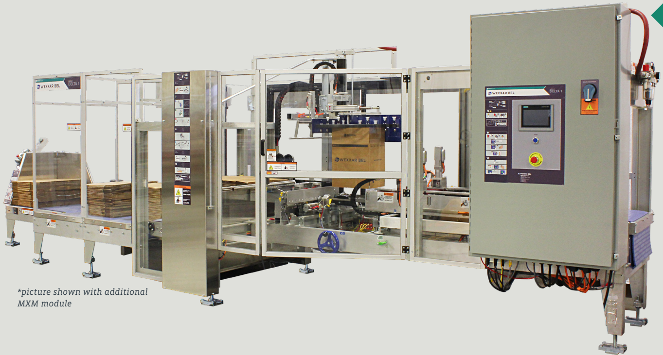
*picture shown with additional MXM module